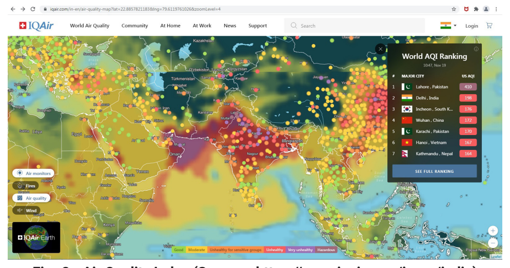
Fig -2 - Air Quality Index

However, air quality is good in the rural areas. Our patient migrated from a coastal area to a temperate region for her nursing studies and had to subsist on infrequent, inadequate hostel food for the last 2 years.